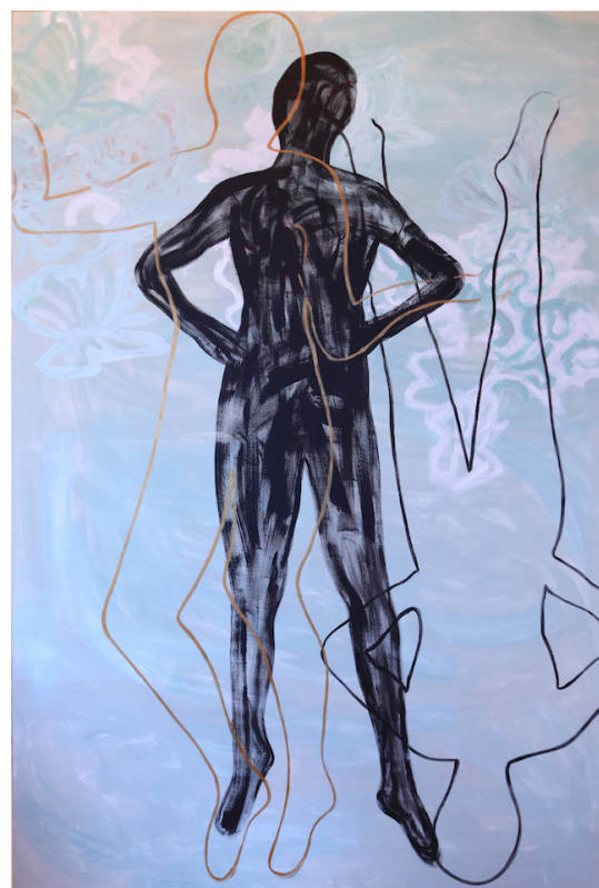
Clockwise Geometrie Femminili - 2015 - Acrylic on canvas - 100 cm x 120 cm Connexion - 2015 - Acrylic on canvas - 180 cm x 120 cm Corpi - 2015 - Iron - 43 cm x 50 cm x 15 cm